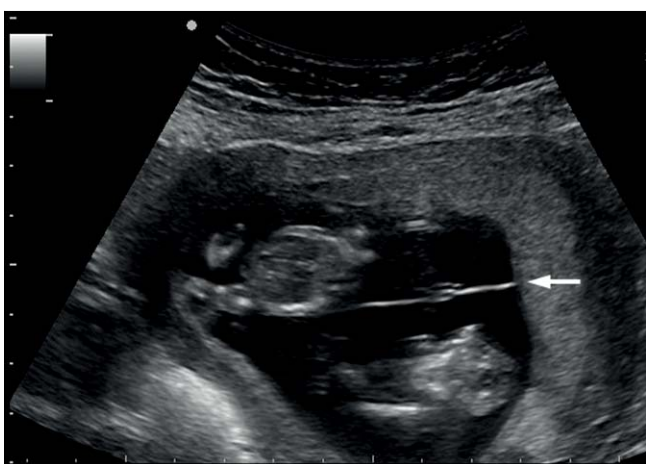
Fig. 4 Monozygotic diamniotic twin pregnancy with T-sign (→), 12 weeks.

Screening should include an assessment of the anatomical integrity of the embryo/fetus. This includes (DEGUM):